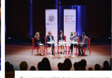
If you want to participate in an upcoming event, please check for the event information in the table below: