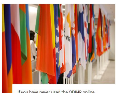
If you have never used the ODIHR online registration system, please Register to create your participant's profile.